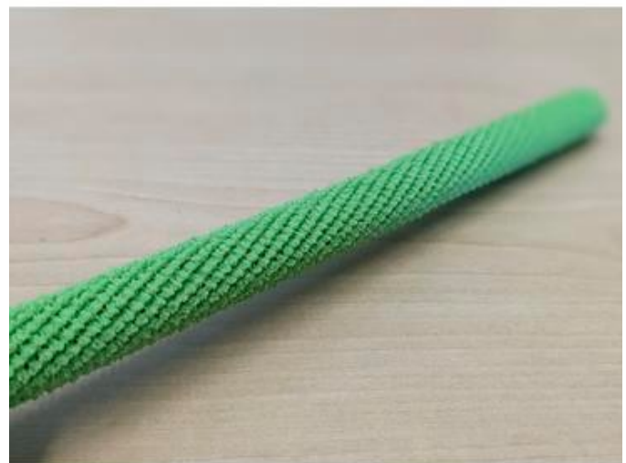
Plant viruses provide naturally occurring nanoparticles that are being repurposed for gene delivery into plant cells.