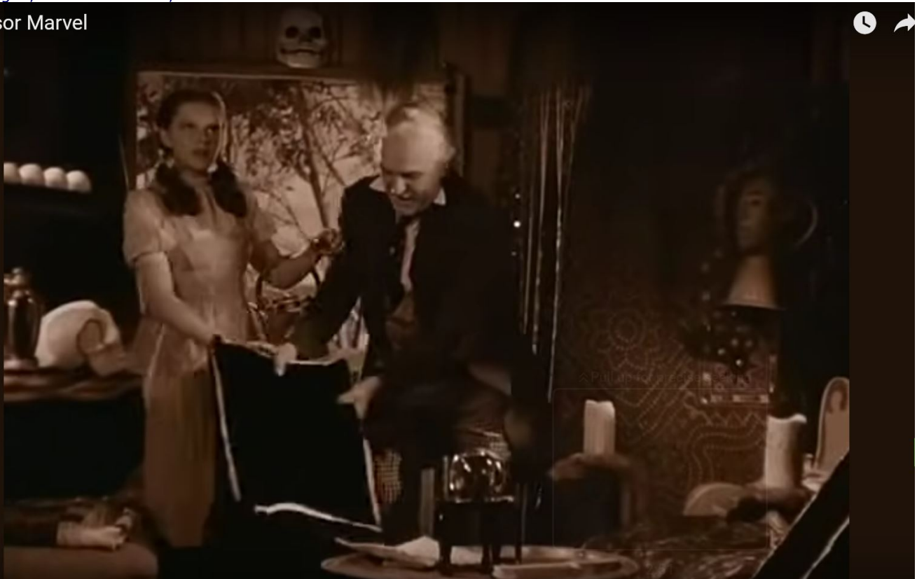
Frank Morgan, Professor Marvel, Wizard of Oz--Chrystal Ball--Used By 'Magicians, Witches'--Back In Egypt, ISIS, Osiris--Used since Antiquity Associated With Witchcraft.JPG